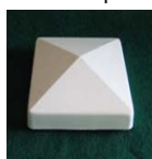
Post Base Trim